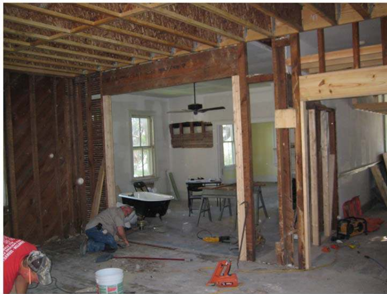
View from Banquette to Dining Room Wall removed to Repair Sliding Door Mechanism