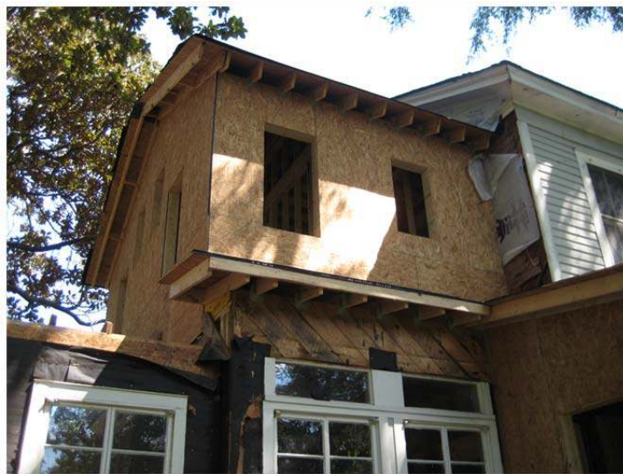
New Second Floor & Reframed roof over Side Porch