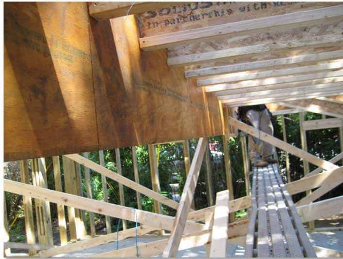
Floor Ceiling Framing in Garage Large 24" deep center beam flush framed with TGI Floor joists