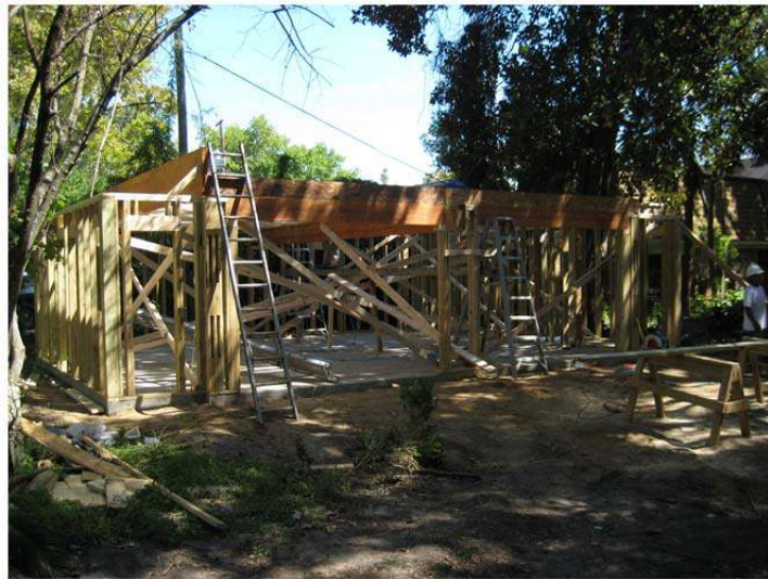
Front View of Garage Framing for Hydrostatic Vents, All wood PT to Plates