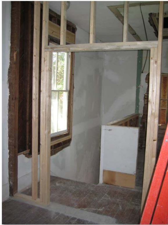
Repositioned Window in Stairwell (Reused from Guest Bathroom)