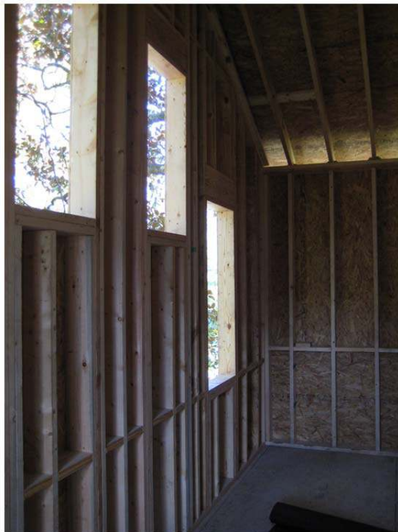
Looking to Shower from Spa/Tub Area (Bottom of Center Windows 80" off floor)