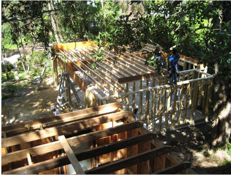
Looking Out Bathroom Window towards Garage Roof of Laundry in foreground