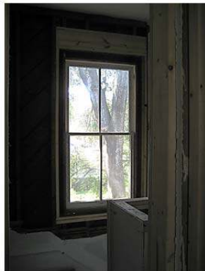
View out New Stair Window