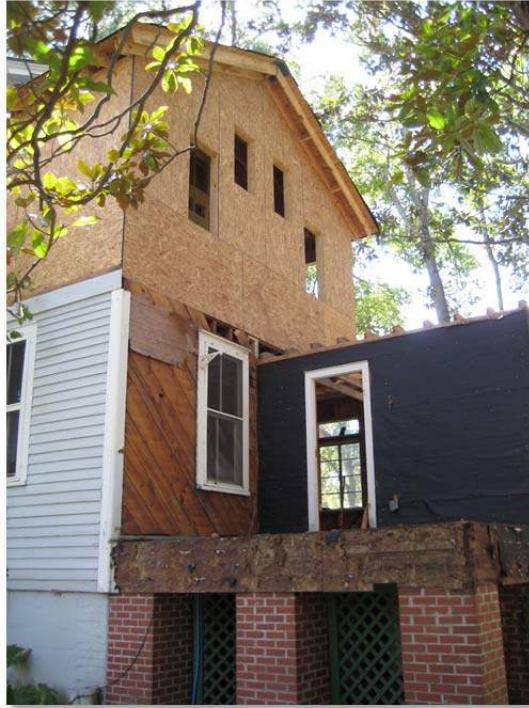
New Second Floor-Roof off rear in prep for reframing

Project 1005 Craven St. Subject: Job Progress Photographs Photo Date: 9.11.12