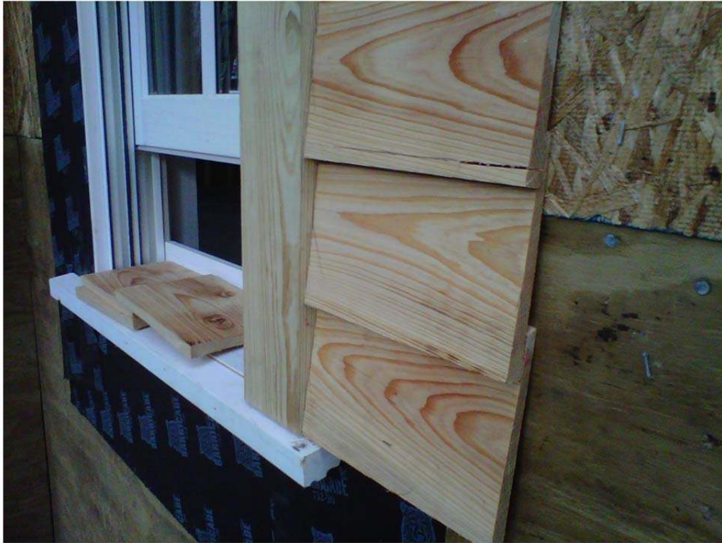
Beveled Siding Puts lap behind 5/4" trim