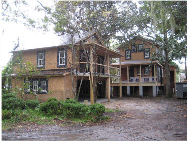
From Rear, Porch Roof in place, Windows Installed Waiting on door delivery

Project 1005 Craven St. Subject: Job Progress Photographs Photo Date: 10.02.12.