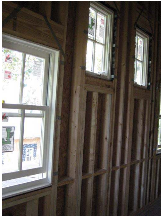
Owner's Bathroom Window Wall