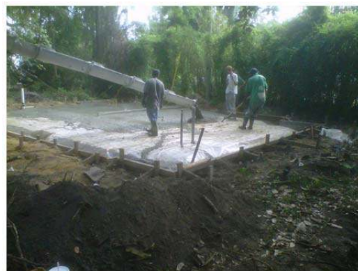
September 7 less than a month ago... Good Job Lance