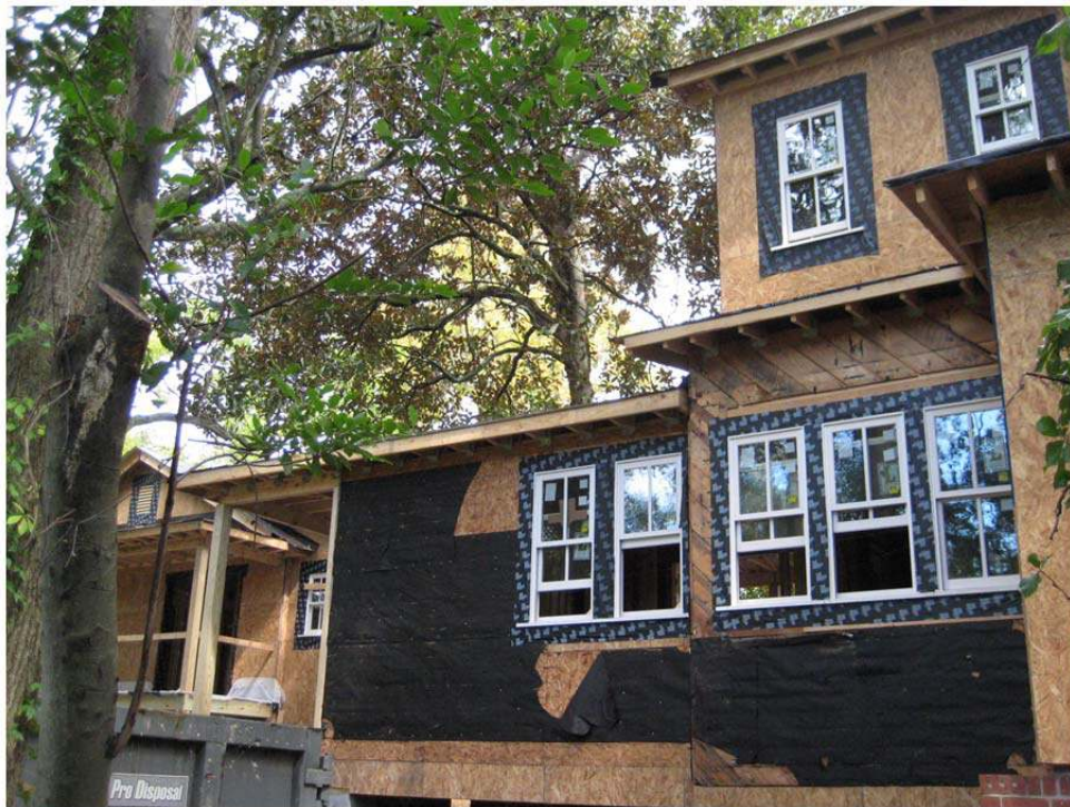
Side facing Rhett House (Garage/Apt in background)