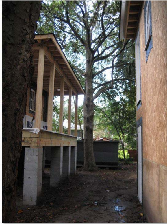
Looking to future "Bridge" & Pergola Porch floor protected from weather by house wrap