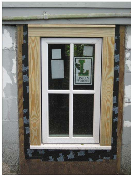
New Window in Lower Level

Smaller Scale trim & drip cap than that on upper portion of House