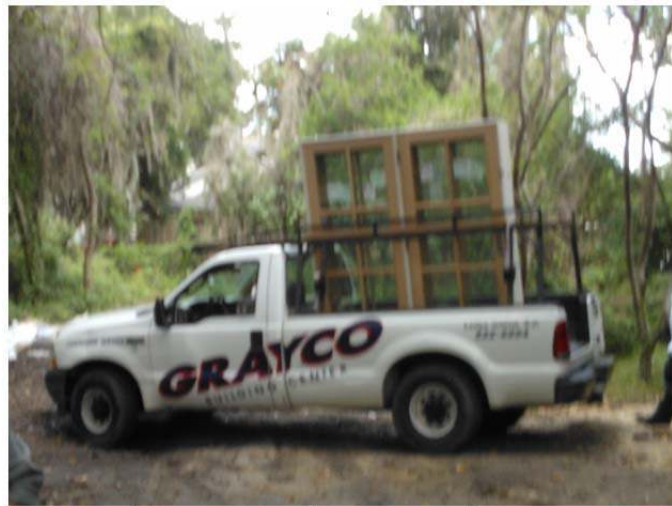
Doors arrive in between rain showers