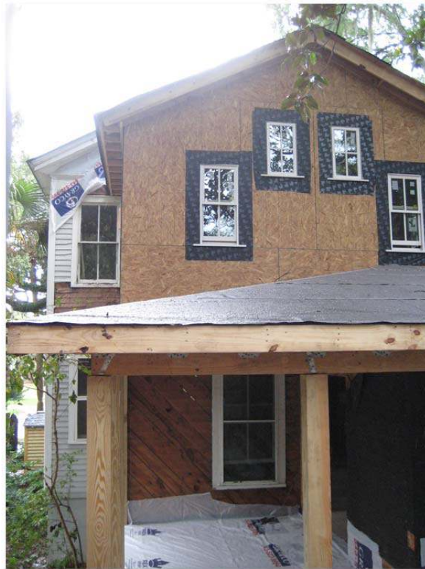
Second Floor with bathroom windows & New Roof over roof over Porch & Laundry