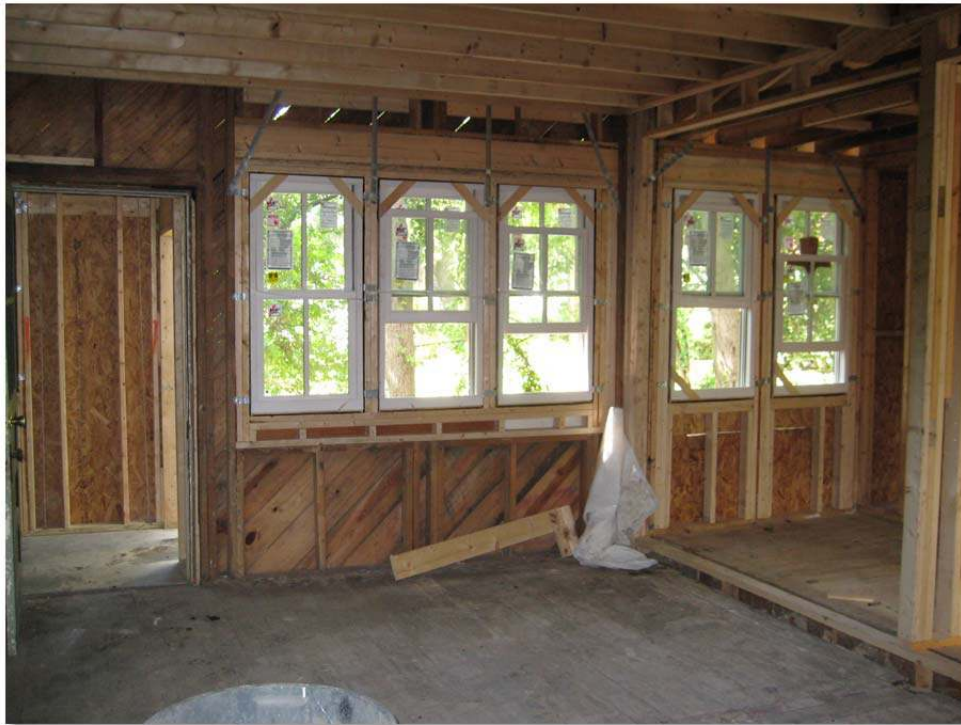
Looking out from Kitchen Sink to Rhett House Yard