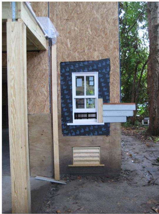
Windows & Hydrostatic Vent, Sample Siding & Trim Note Column strapping to face of porch beam