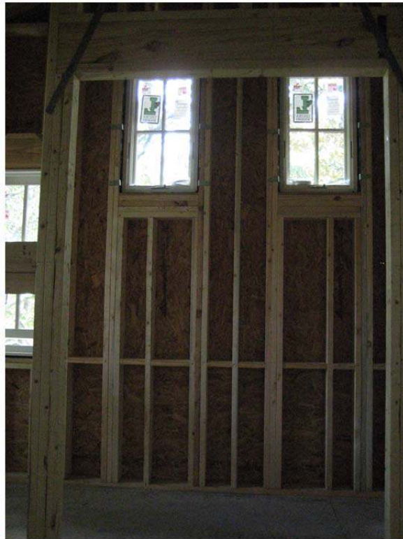
To owners Bath from Dressing - Vanity sinks to be centered below windows