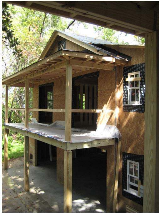
Looking to Garage from Screen Porch Note beam above