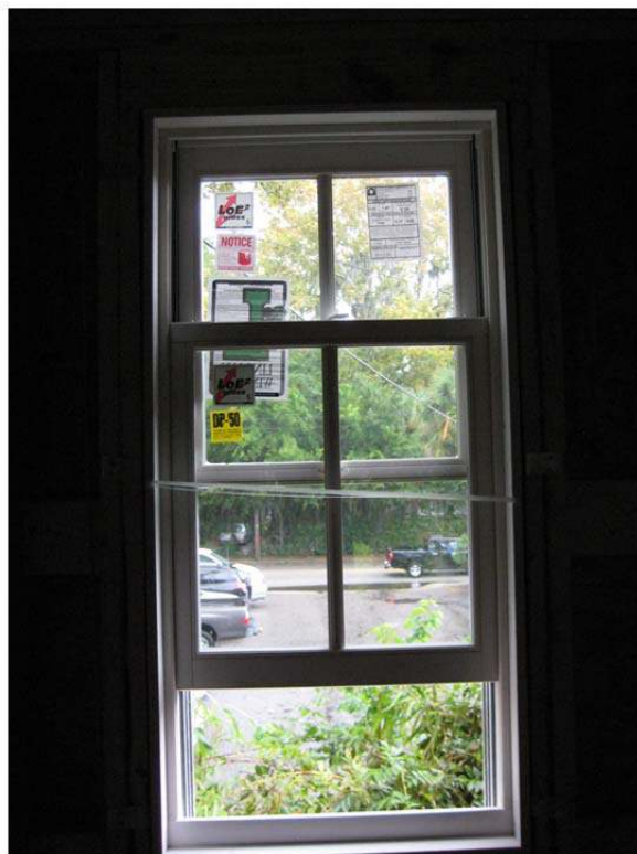
View out of Window at sink in Apartment looking to Charles Street